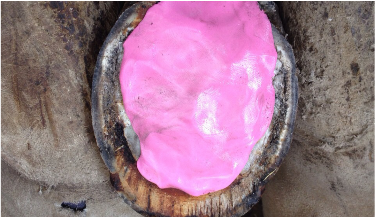
Shudim soft A25.