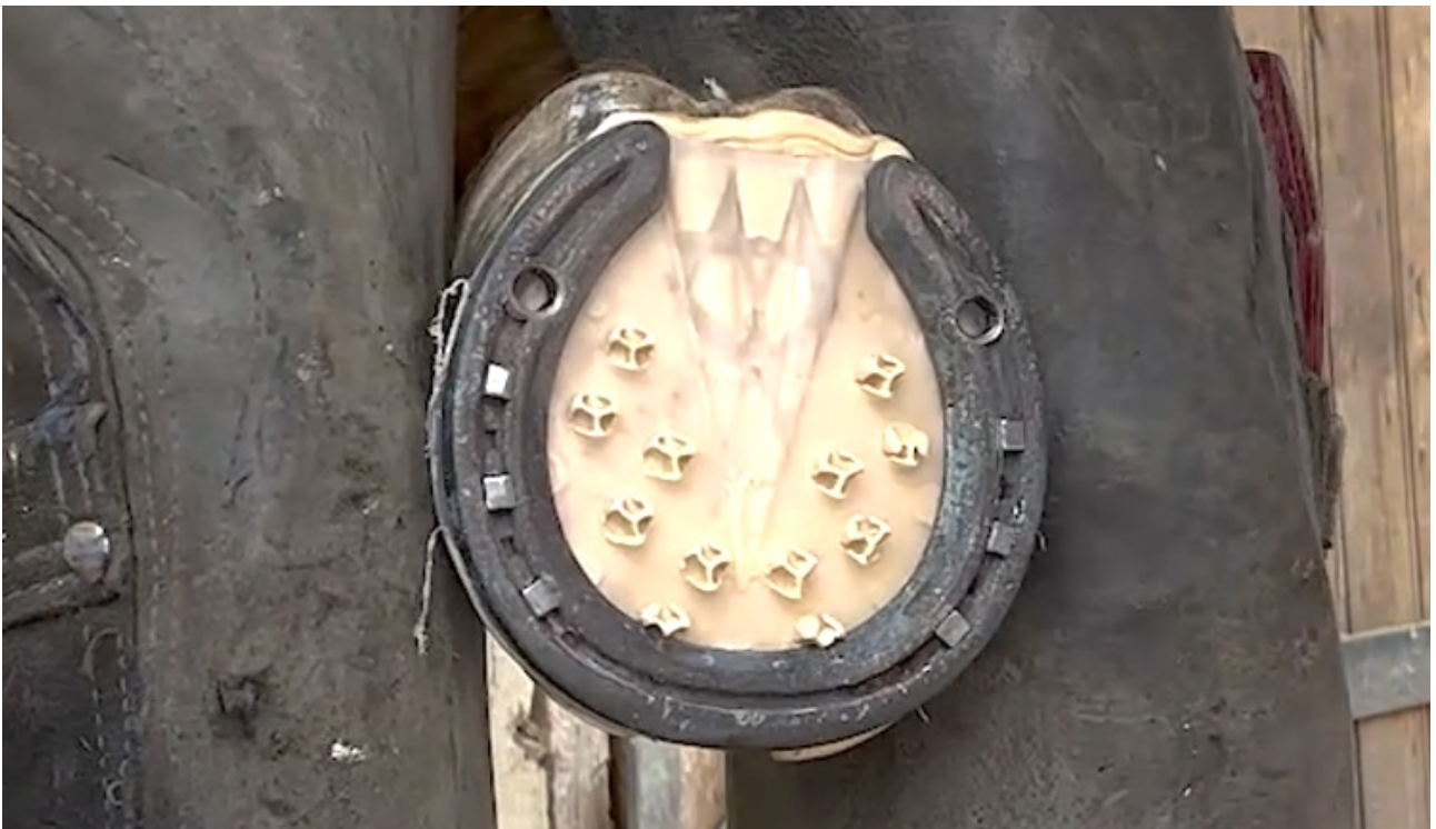
Shudim air with pad.