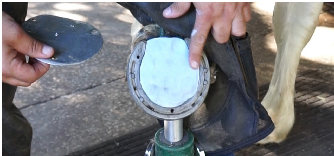
Shudim super soft A15.